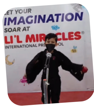
CLICK TO VIEW THE VIDEO

Our preschoolers enjoyed listening to and retelling stories in their own words. Our Sr. KG students confidently presented stories in their own words, bringing characters and events to life with enthusiasm. This engaging activity helped enhance their communication skills, creativity, and confidence while encouraging them to express their thoughts and ideas.