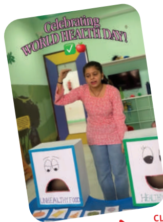
CLICK TO VIEW THE VIDEO

At Li'l Miracles International Preschool, we believe that healthy habits begin early — and World Health Day was the perfect reminder of that! On World Health Day, our little learners discovered the importance of healthy habits and nutritious food. Through fun activities, they learned to identify healthy and unhealthy food choices and understand how good habits help us stay strong and healthy.