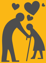
Grandparents Day Celebration