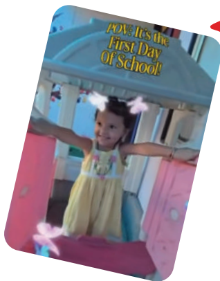
CLICK TO VIEW THE VIDEO

The gates of Li'l Miracles International Preschool opened once again with tiny feet, big dreams, and even bigger smiles! From hesitant goodbyes at the gate to cheerful high-fives inside the classroom. The day was filled with warm welcomes by our teachers, fun ice-breaking games to ease those first-day jitters, and most importantly, hugs, laughter, and happy tears