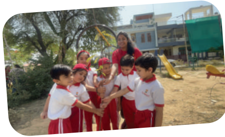
CLICK TO VIEW THE VIDEO

Our little learners took meaningful steps towards becoming environmentally responsible citizens through engaging plantation activities. While our Nursery and Jr. KG children learned about caring for nature through storytelling, our Sr. KG students planted trees in a nearby society garden. Our continue to visit and care for these trees, nurturing not just nature but also a lifelong sense of responsibility and love for the environment.