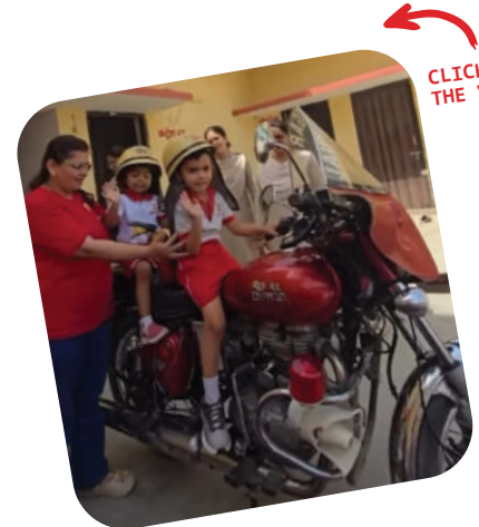
CLICK TO VIEW THE VIDEO

We took our kids on a field trip to the fire station in celebration of Firefighter Day, while also introducing them to the importance of community helpers as part of their broader curriculum to meet real-life heroes in action! They got a close look at fire trucks, safety gear, and even watched a live demo of how firefighters respond in emergencies. The trip was not just thrilling, but also a meaningful reminder of the bravery, teamwork, and selfless service that community helpers bring into our lives.