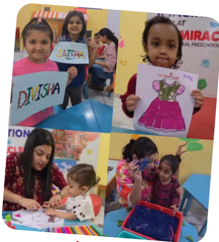
CLICK TO VIEW THE VIDEO

Our Summer Camp was a wonderful blend of fun and learning, where children enjoyed engaging activities while developing important life skills and good habits. Through hands-on experiences, games, and creative sessions, our little learners made happy memories and spent their summer in a meaningful and enjoyable way.