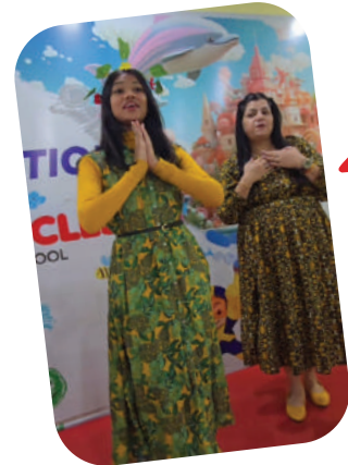
CLICK TO VIEW THE VIDEO

Through an engaging and interactive story, our little learners discovered the importance of protecting the Earth. They learned how reducing the use of plastic and choosing eco-friendly alternatives can help keep our environment clean and healthy. The story inspired children to become responsible caretakers of our planet from an early age.