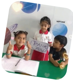
CLICK TO VIEW THE VIDEO

Our little preschoolers learned the importance of using magic words through an engaging class activity such as "Please," "Thank You," "Sorry," and "Excuse Me." Through fun activities and discussions, they discovered how these simple words show kindness, respect, and good manners, making everyday interactions happier and more pleasant.