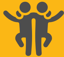
Friendship Day Celebration