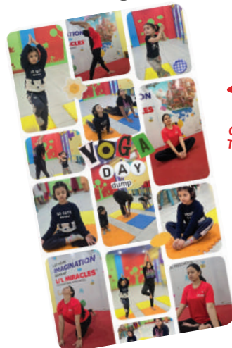
CLICK TO VIEW THE VIDEO

On International Yoga Day, our little yogis at Li'l Miracles International Preschool, rolled out their mats and stepped into a world of calm and balance. With guided breathing, playful poses, and lots of laughter, children explored the joy of movement and mindfulness. From the 'butterfly pose' to 'tree pose,' the morning was filled with stretches, giggles, and a beautiful sense of peace. We believe that introducing yoga early builds not just flexibility, but focus, self-awareness, and emotional strength — and we're so proud of our little ones for embracing it with such joy!