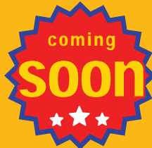
Something New & Big Coming in Store